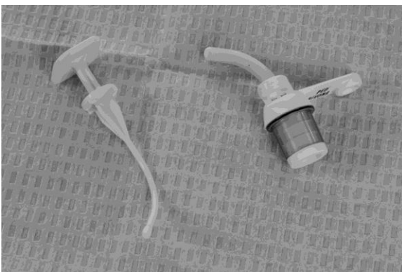
Trach tube and obturator drying on paper towel

This document is not intended to take the place of the care and attention of your personal physician or other professional medical services. Our aim is to promote active participation in your care and treatment by providing information and education. Questions about individual health concerns or specific treatment options should be discussed with your physician.