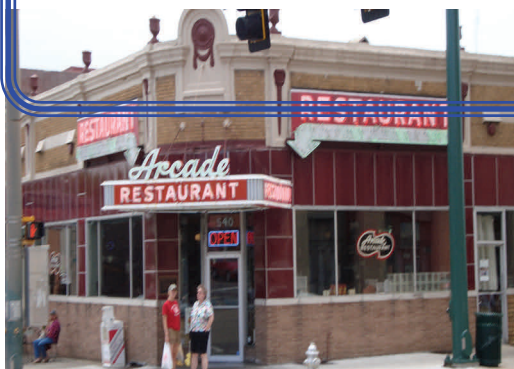
The Arcade Restaurant on Main Street is the oldest restaurant in Memphis - opening in 1919

For questions, email: APOTempHousing@stjude.org