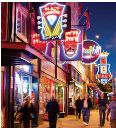
Beale Street ~ Home of the Blues

Standard Lab Schedule: Students are typically in the lab around 40 hours per week. This consists of 40 hours divided up as 8 hours per day, 5 days per week. The bulk of the 8 hours should fall between the hours of 8:00 am and 6:00 pm. Your lab may have more specific requirements that will take precedence over this general guideline.