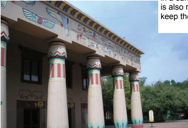
Egyptian Styled Entrance to Memphis Zoo in Overton Park

Be sure to carry a photo-copy of your DS 2019 in your wallet while in the U.S. Your original and your passport should be kept in a safe location. When you receive your Social Security Card, it is also recommended that you carry a copy in your wallet and keep the original with your passport and other important papers.