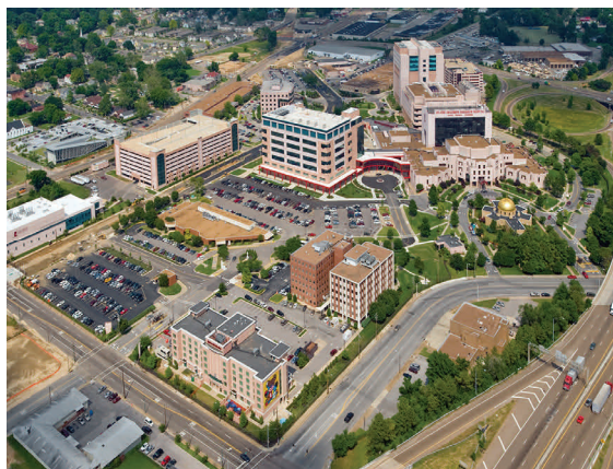
St. Jude Children's Research Hospital

Congratulations on your opportunity to join us at St. Jude Children's Research Hospital as you progress in your studies! We hope this experience is complete with new and enhanced research skills and