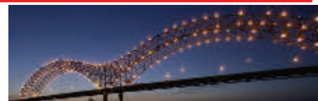
Bridge Across the Mississippi River

Congratulations on your opportunity to join us at St. Jude Children's Research Hospital as you progress in your studies! We hope this experience is complete with new and enhanced research skills and