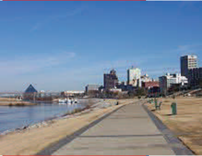
Memphis Skyline as seen from Tom Lee Park

There is a saying in Memphis - "If you don't like the weather, just wait a minute" .