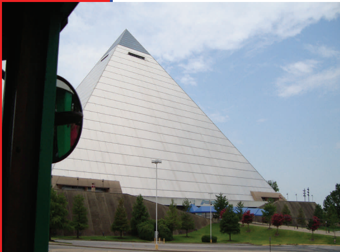
The Pyramid on the banks of the Mississippi River

Please, do not let these occurrences worry you, as they are very rare, but you do need to be informed about what to do in the case of an emergency.