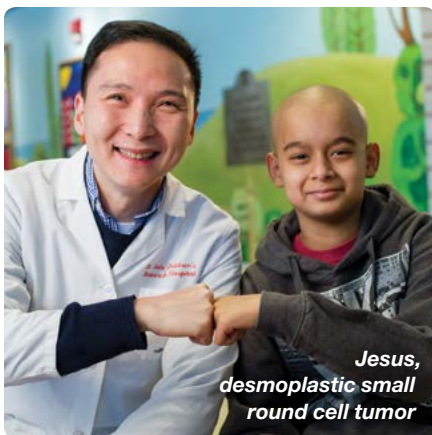
Jesus, desmoplastic small round cell tumor